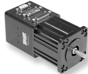
SM2320D-PBP shown with Profibus option "Plus" firmware