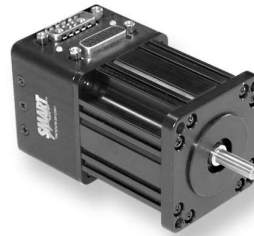
SM2320D shown with standard D-sub connector