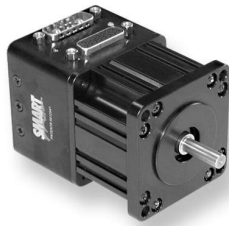
SM2310D shown with standard D-sub connector