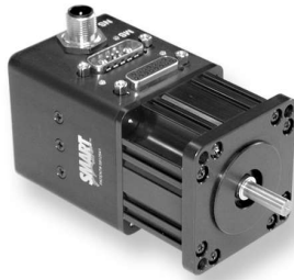
SM2310D-DNP shown with DeviceNet™ option "Plus" firmware